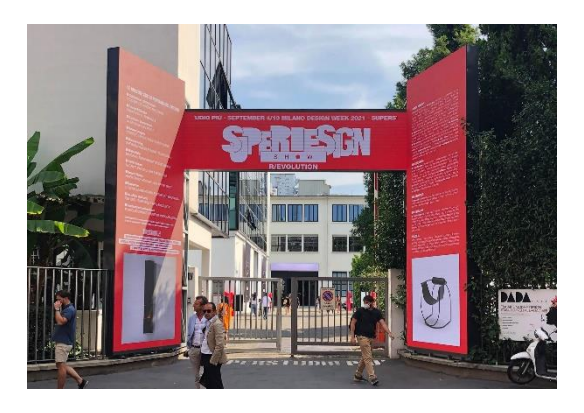
Living Divani @ Cult&Must 2000/2020