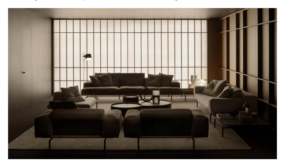
"This project is a kind of second episode of a story, where the first chapter was the Gallery with its artistic approach. Now the Gallery is expanding, is growing to tell a second chapter, that is always a Living Divani way of presenting itself, but perhaps more delicately, gently ... And by including lots of greenery: instead of building terraces we have designed spaces as if they were terraces." Piero Lissoni

Only one year after its opening Living Divani Gallery, the brand's new reference point in Milan, expanded featuring new exhibition areas that develop in continuity while experimenting with new languages, in a surprising stylistic mix capable of enchanting for the perfect harmony. The showroom in Corso Monforte 20 thus grows to accommodate the brand's icons together with the latest 2021 novelties, revealing at once the spirit and the soul of the Living Divani collection in continuous evolution.