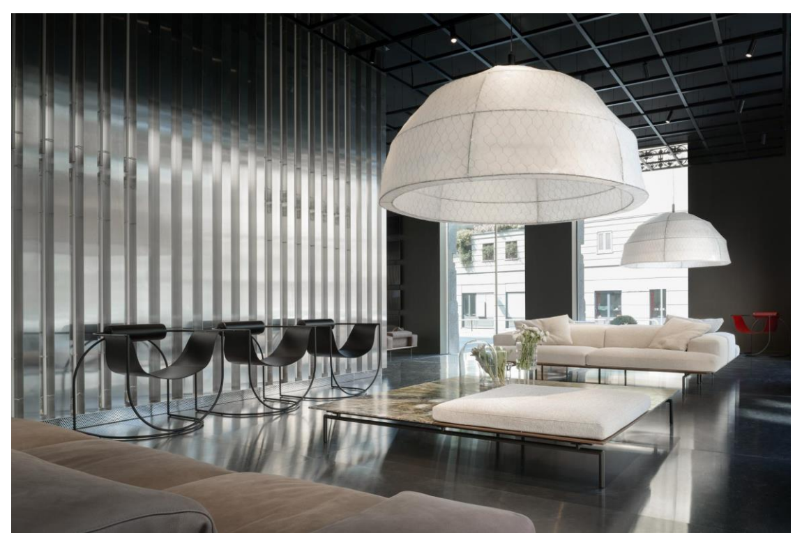
Discover all the images of this new set-up

Protagonist of the scene the Sumo collection, signed by Piero Lissoni , completes the proposal combining the sofa and dormeuse variant, launched in 2020 and characterized by a lenticular basis, with new sofas and elements such as benches, low tables and armchair, in a fluid unicum that also includes the new Moon coffee tables by Mist-o and the Lemni armchair by Marco Lavit .