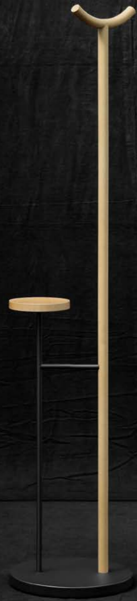
— Coat Hanger with structure in natural oak and base with gunmetal grey lacquering