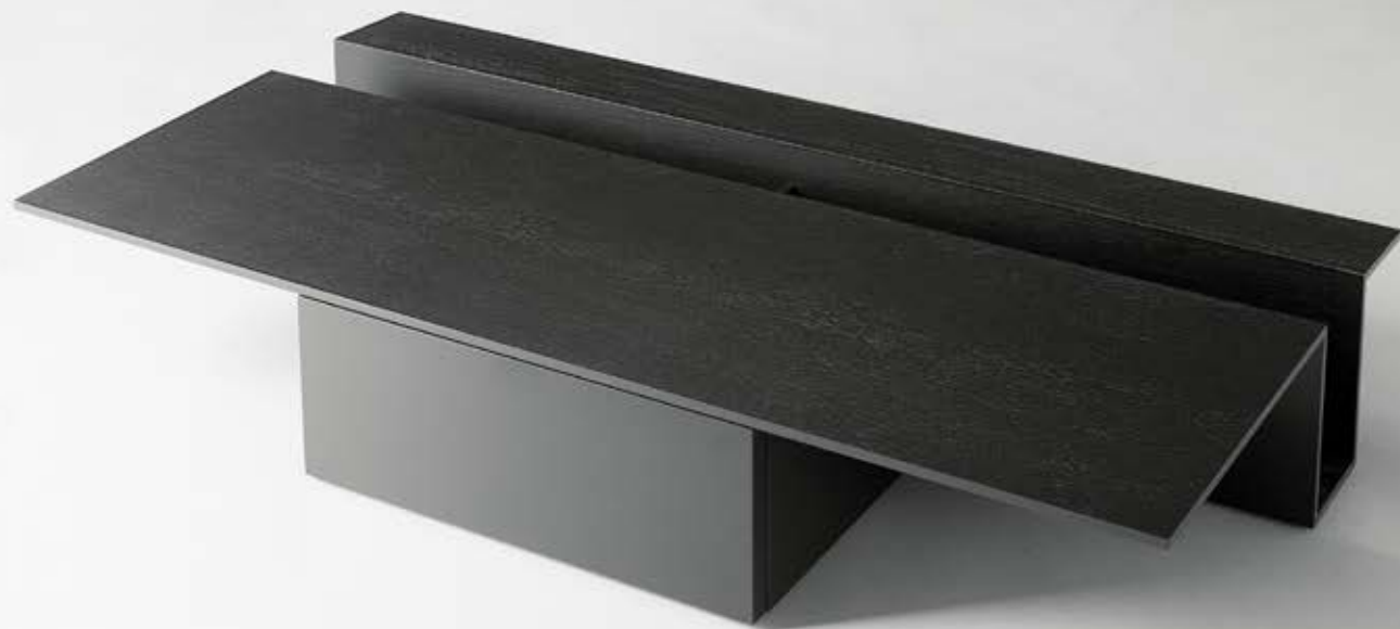
— Grek low table with top veneered in charcoal-dyed oak